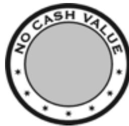
No cash value bi-metal 1