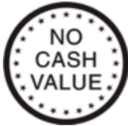
No cash value 2