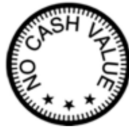
No cash value 3