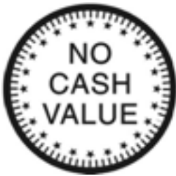
No cash value 1