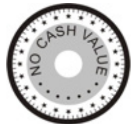
No cash value bi-metal 2